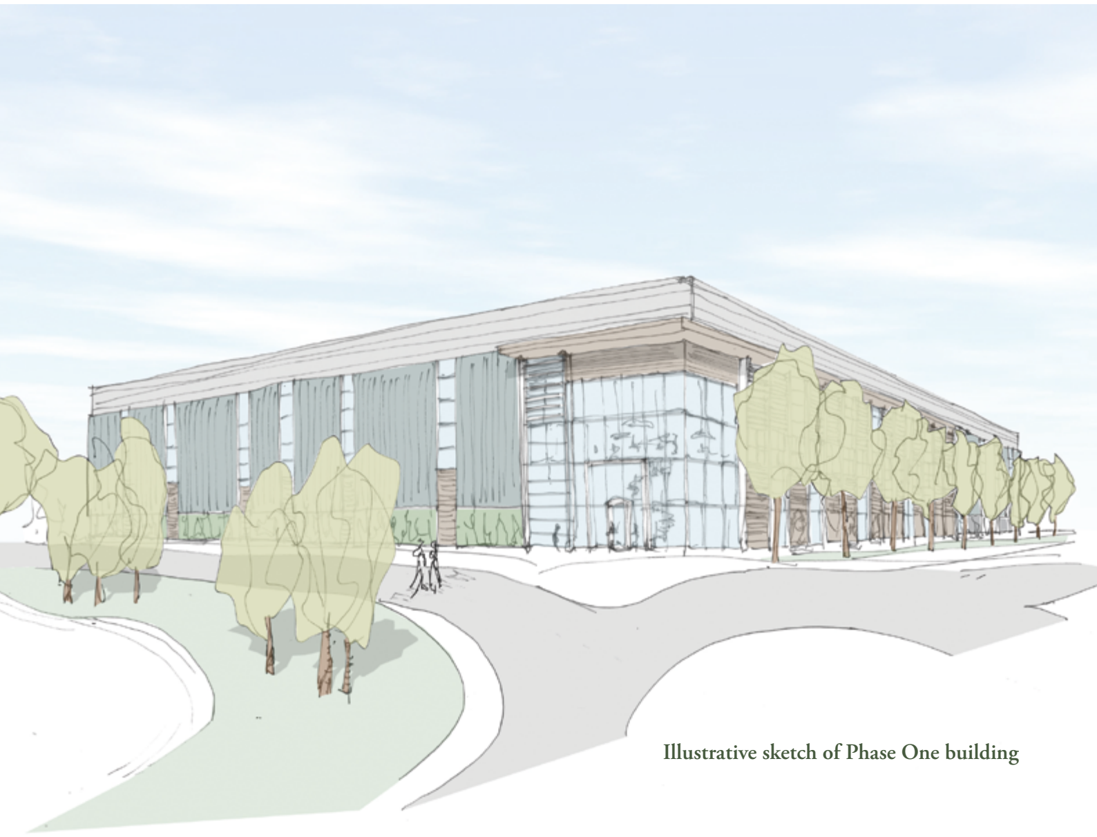
Illustrative sketch of Phase One building

The drainage strategy seeks to incorporate additional sustainable drainage systems, to improve water quality, ecological and amenity value, while ensuring flood risk is not increased elsewhere.